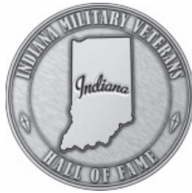
The Indiana Military Veterans Hall of Fame Medallion