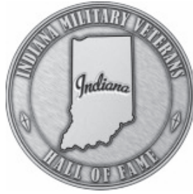
The Indiana Military Veterans Hall of Fame Medallion