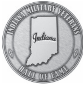
The Indiana Military Veterans Hall of Fame Medallion