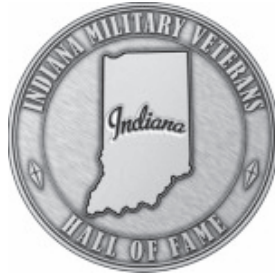
The Indiana Military Veterans Hall of Fame Medallion