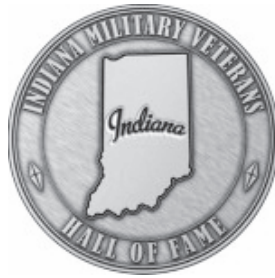
The Indiana Military Veterans Hall of Fame Medallion