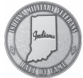
The Indiana Military Veterans Hall of Fame Medallion